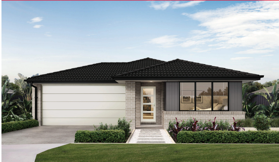
EVANS 24_229 | METRO RANGE